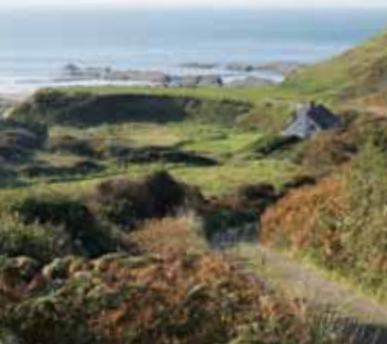
Much more than just an historic house